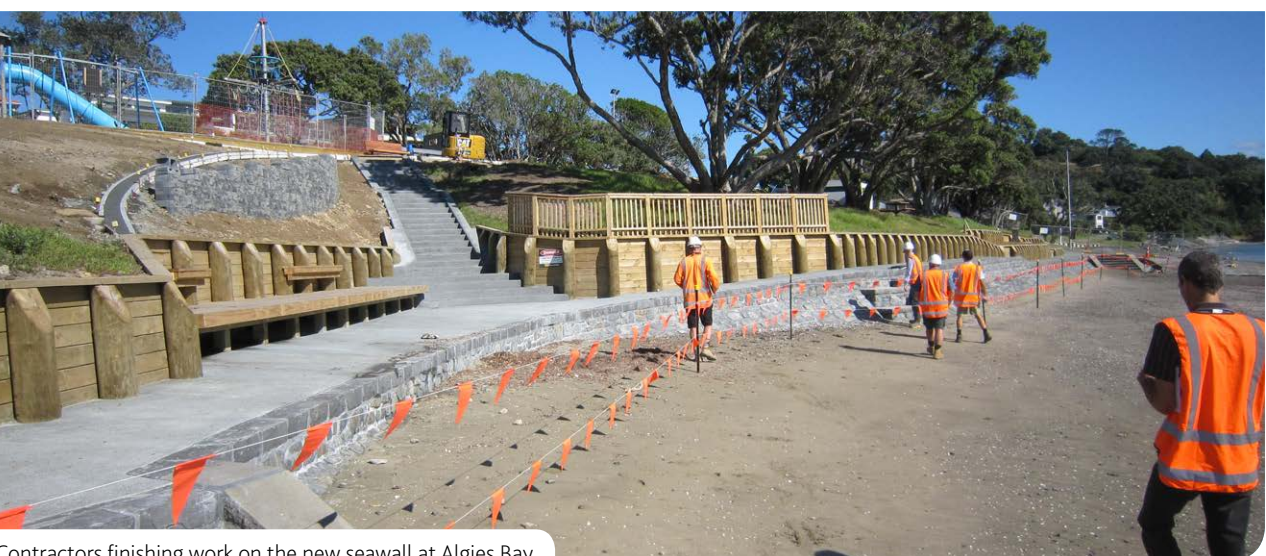
Contractors finishing work on the new seawall at Algies Bay.

This report also reflects the local flavour of your area profiling its population, people and council facilities. features a story about a council or community activit adds special value to the area and demonstrates how together we're delivering for Auckland.